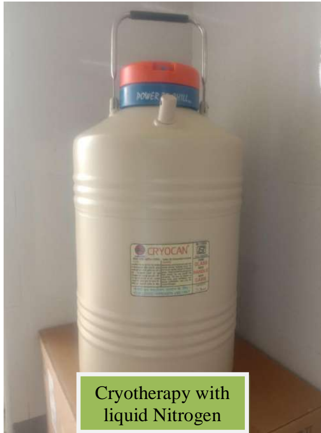
Cryotherapy with liquid Nitrogen